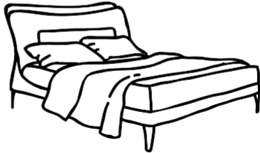
Double Bed A 1- 2 people