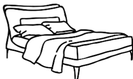
Bed E large single -1 person