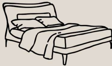
Upstairs Day Bed 1- Person