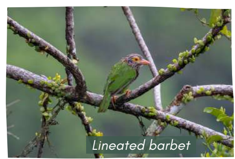
Birds such as these can be seen regularly at the lodge