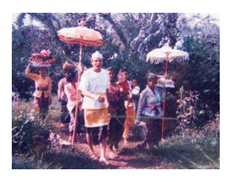
Early Days at Sarinbuana